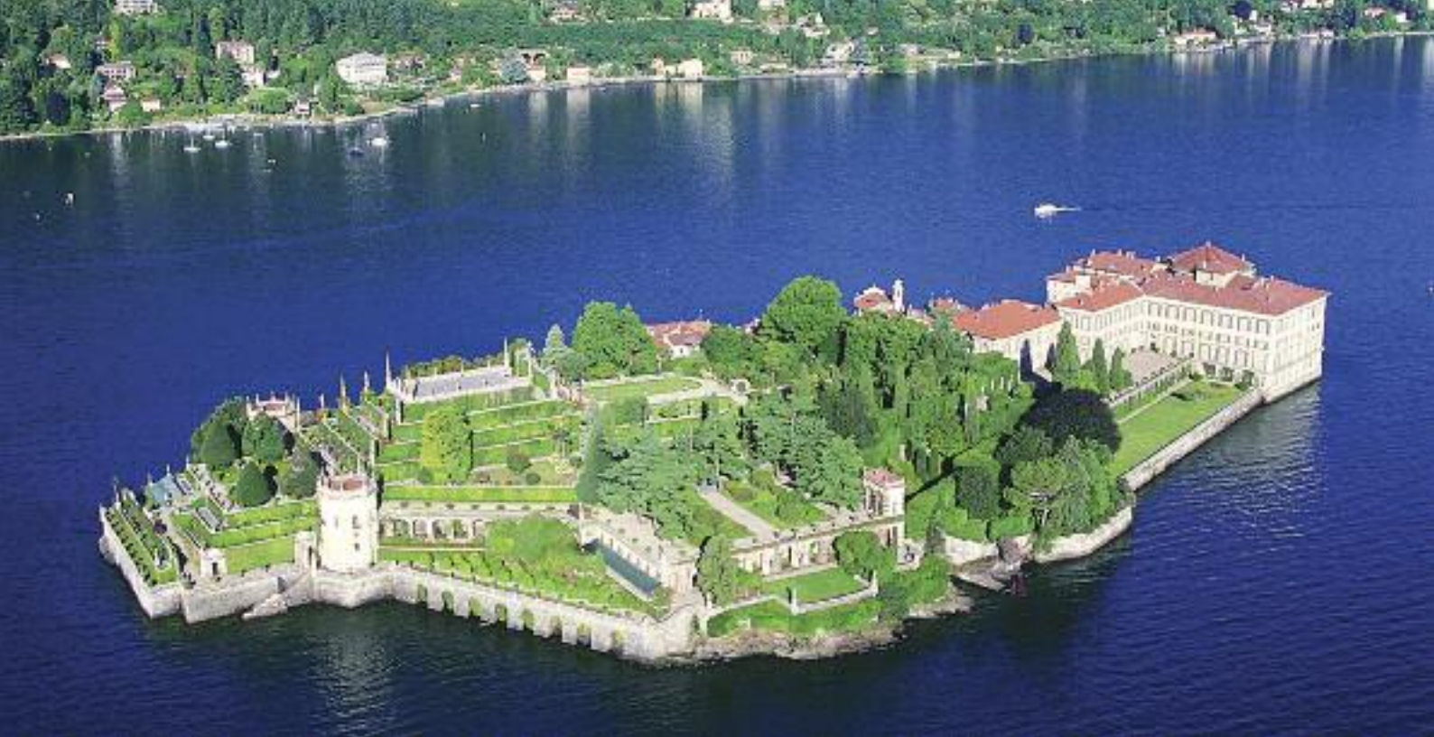
Italy – Lake Maggiore – Isola Bella

Skilful restoration and sensitive modernisation have brought the original magnificence back to life. Guelph style decorative battlements, stone cellars, tapestries, swords and suits of armour set the scene for the elegant halls, dining rooms, manicured gardens and terraces overlooking the valley. Glorious for those après dinner drinks on those long summer evenings! For more information look at http://www.castelbrando.it