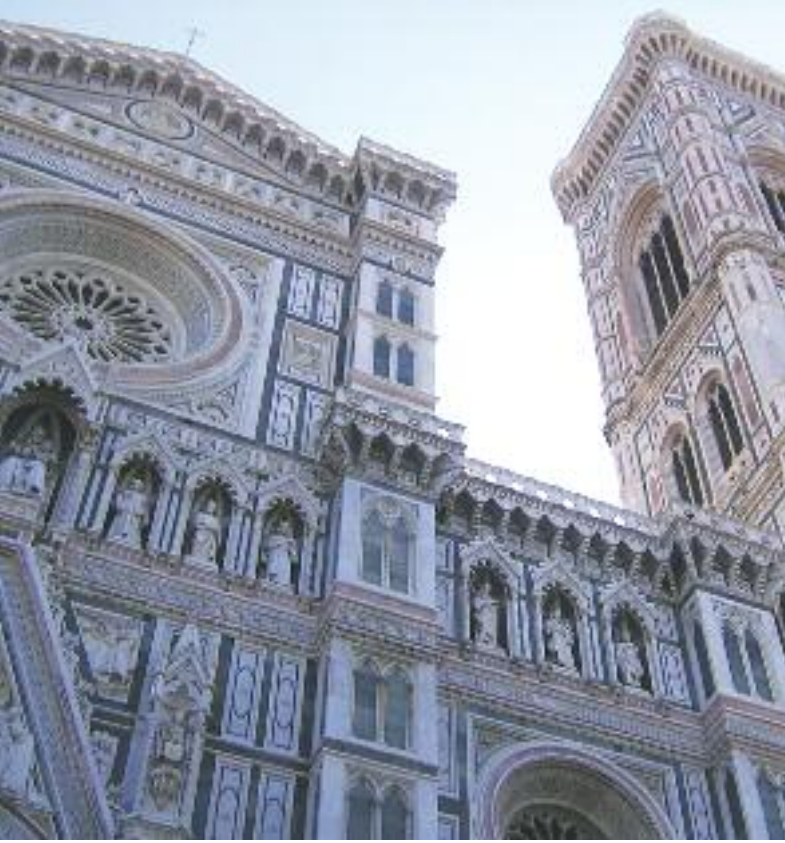
Basilica de Santa Maria del Fiore Florence

Siena amongst the great sights such as the Gothic Town Hall and the Piazza del Campo, scene of the famous Palio horse race. Next we wind up to the hills of Umbria and the wonderful walled town of Spoleto where we stay the next two nights. Medieval Spoleto is easily explored on foot. There are numerous Romanesque churches and cobbled stone alleyways with character shops, bars and trattorias. (B, D)